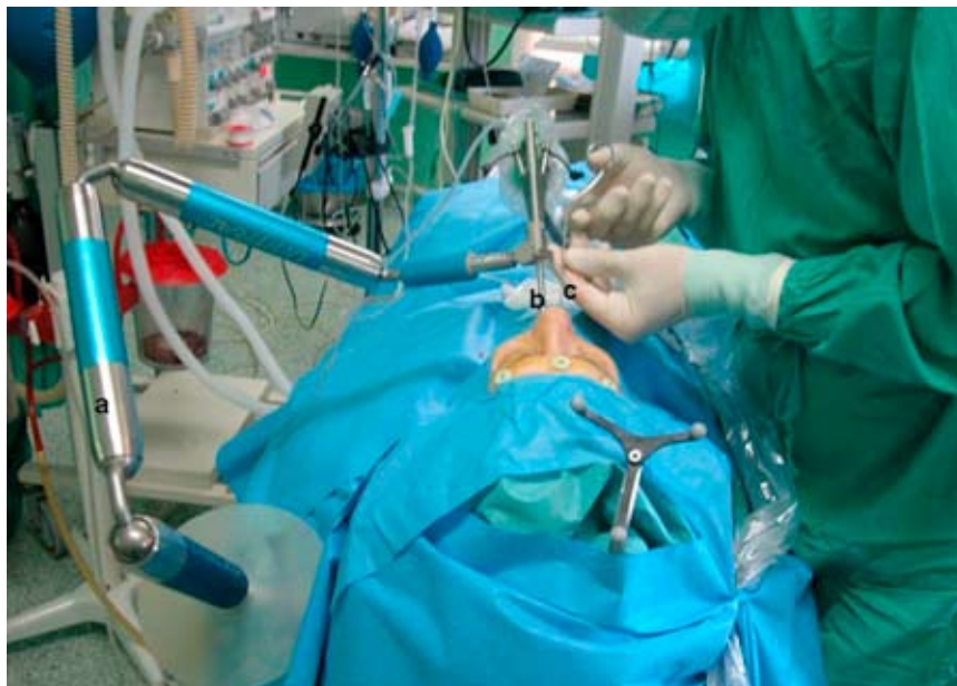
Figure 1 Layout of the surgical field: a) Unitrac articulated arm; b) optics; c) surgical instruments.

From this surgical step, the approach is combined: optics are introduced through the left nostril and are held and stabilised by the Unitrac pneumatic swivelling clamp (Aesculap, Tuttlingen, Germany). The neurosurgical instruments for tumour resection are inserted through the right nostril (Figure 1).