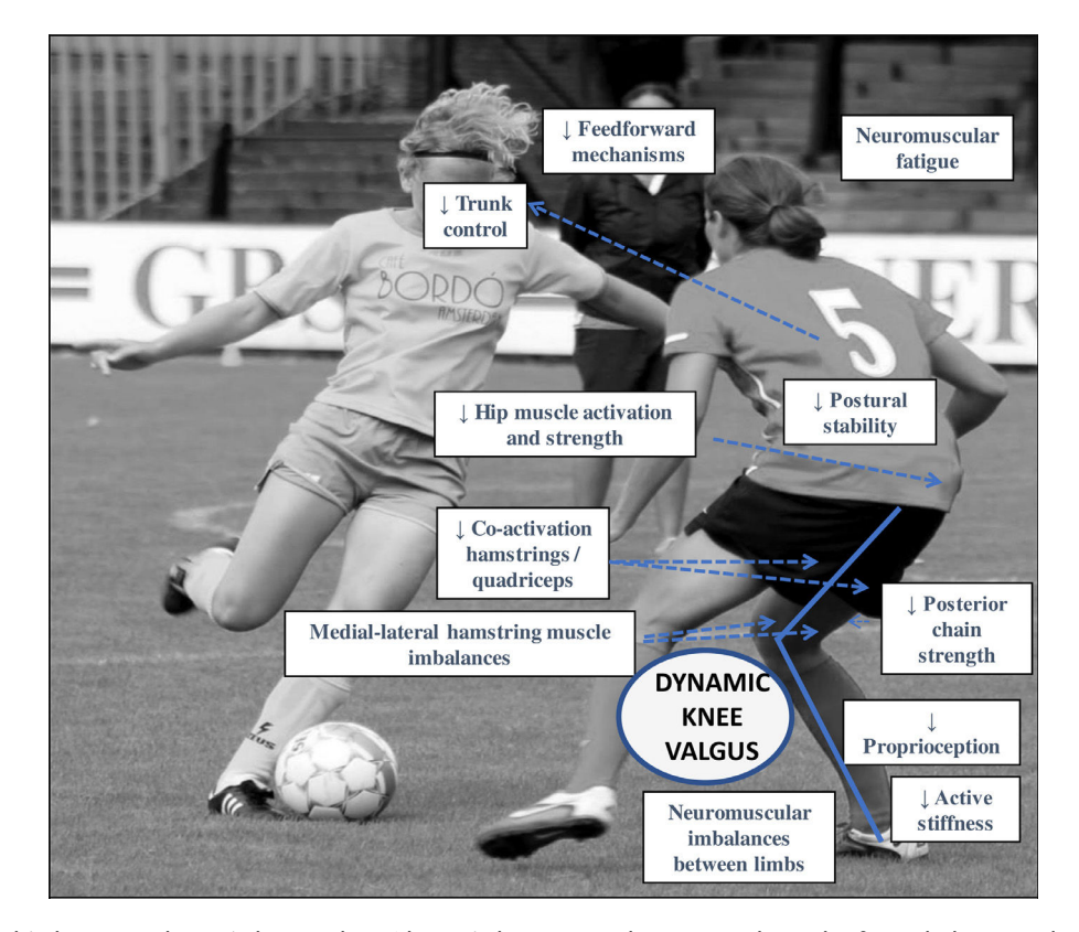
Fig. 2 Relationship between dynamic knee valgus (dynamic knee control strategy where the frontal plane predominates) and associated neuromuscular injury risk factors.

In addition to injury etiology, to return athletes to sport it's important to understand the characteristics of team sports