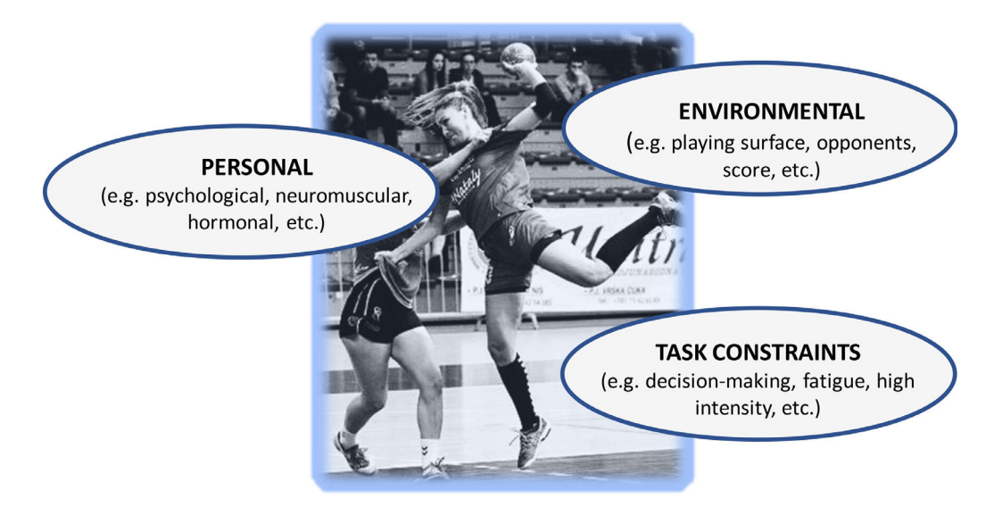
Fig. 1 Multifactorial etiology of anterior cruciate ligament (ACL) injuries in team sports. The interactions among personal factors, environmental factors, and task constraints can create conditions for ACL injury.

Mechanisms of ACL injury vary by individual, by sport, and by sport-specific situations. Though each ACL injury is unique, many of the injuries sustained during team sports have common elements. A majority of ACL injuries are non-contact injuries, which account for 37.5–85% <sup>13,14</sup> of all ACL injuries. In addition, the most common non-contact mechanisms of injury during sport are a combination of deceleration,